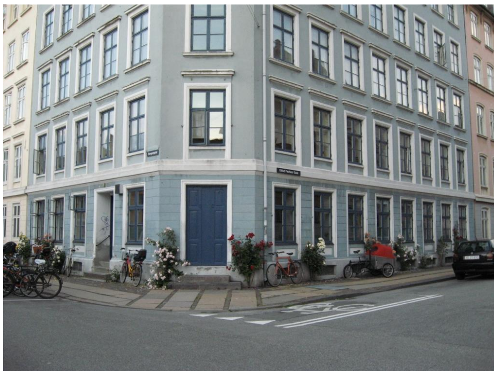
Streetcorner, 19th century, Copenhagen, Denmark