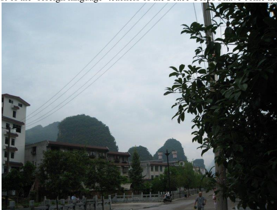
Yunan, China. A backtracker teacher's paradise

Direct exposure to the foreign language taught is important: self study units open for long hours are probably better than boring classes in language laboratories with teachers who cannot figure out what buttons to press. Videos and films from cultural, educational, tourist and export institutions are often available. A native speaker is a godsend, but volunteers are quite often young and nearly always inexperienced in pedagogics, like the trekkers in China I mentioned above, and most of the 'foreign language' teachers of the Peace Corps I have come across.