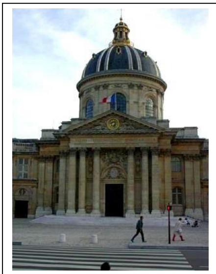
The Academie Française, Paris, France

The French effort is more visible: ‘l’Académie française’ (founded in 1634) functions as the guide of correct French usage, the ‘l’Institut Français’ promotes French and there is a ‘service culturel’ in out of the way places. French language policy is directed by a Parisian-based body of 80-100 experts, and goes hand in hand with both foreign trade (‘là où on parle français on achète français’) 7 and foreign policy, most obviously so in the French military interventions in former, but still Francophone, colonies in Africa (Gabon, Senegal, etc. (Zaire used to be a Belgian colony)). French has lost ground with younger generations in the ‘near abroad’ (Italy, Spain), but not in distant parts of the former empire. vii In certain countries and regions, French is the lingua franca. Yet as presently executed, the French language promotion is rigid and fails to properly understand the difference between the imposed dominant language and the voluntarily accepted lingua franca: The anti-Franglais policy may make for an official, pure, predominantly written French versus an unofficial, predominantly oral French with international loans among the younger generations even in France, thus undermining it from within.