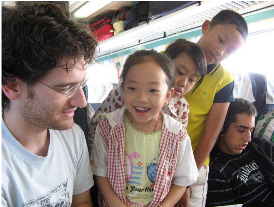
Teaching English to Chinese children

One relevant parameter is whether governments are aware of the need to boost the effort to learn foreign languages. For instance, in Poland and in Slovenia there seems to be a significant awareness in the Ministries of Education, and they therefore cooperate with foreign bodies. Conversely, Hungary saw severe staff cuts at universities because of stringency measures (1995), which is perhaps understandable from a financial perspective. Until then, the World Bank had poured money into upgrading foreign language teaching. Incredibly enough, Hungarian politicians and bureaucrats did not include modern language teaching in the priority areas with international assistance programmes (EU or US) in order to lessen the blow when there was no more World Bank support. This is, at best, a case of // ... 92// poor foresight and, of course, also evidence of naive political and bureaucratic beliefs that language command is something static which you acquire once and for all. Although the case of Hungary is most conspicuous, similar patterns are repeating themselves on a smaller scale over most of the East bloc. As far as I know, there is no officially recognised need for foreign language teaching in China. viii