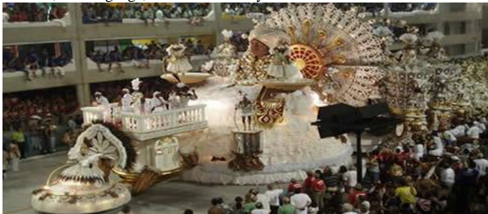
Float from Brazilian Carnival

Further, the sheer geographical size and the wealth of natural resources allow the US to be largely self-sufficient. The same is the case with many other large nations, for example, China, India, and Russia. Yet they differ in terms of official recognition of multiethnicity. For this, Brazil offers the closest parallel with one nation, one language, and multiethnicity.