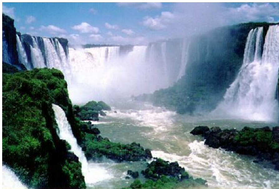
The Iguazu Falls between Spanish-speaking Argentina, Paraguay, and Brazilian-speaking Brasil

Universal Declaration of Linguistic Rights . Eleventh draft. November 1995. Barcelona: International PEN.